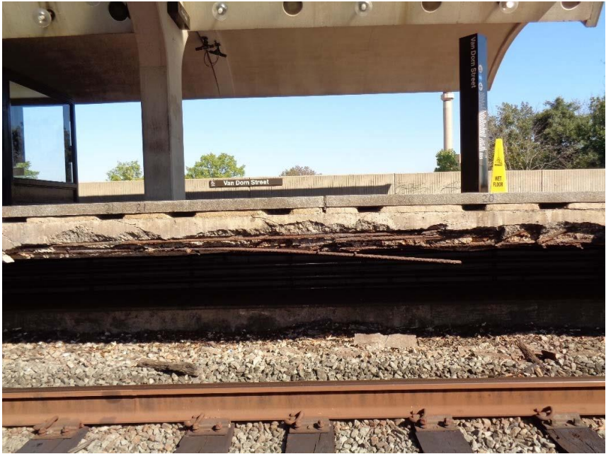
Van Dorn Station