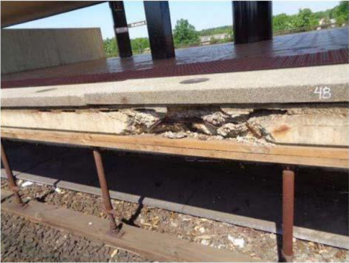
Braddock Road Station