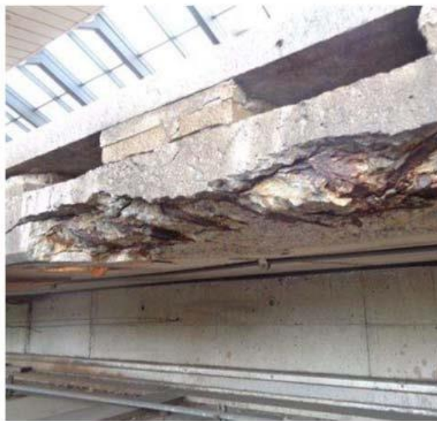
King St Station