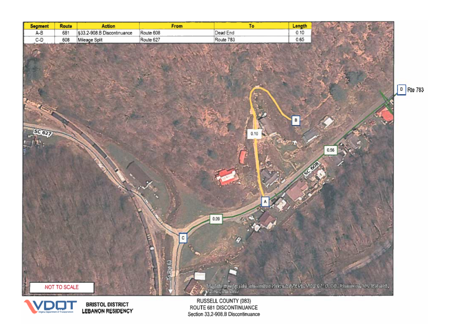
Exhibit B Sketch of Proposed Road to be Discontinued