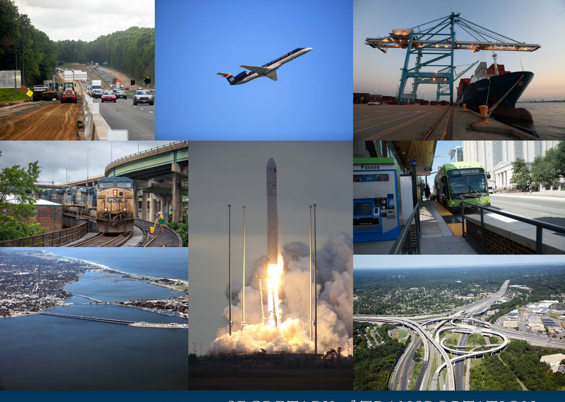
Office of the SECRETARY of TRANSPORTATION