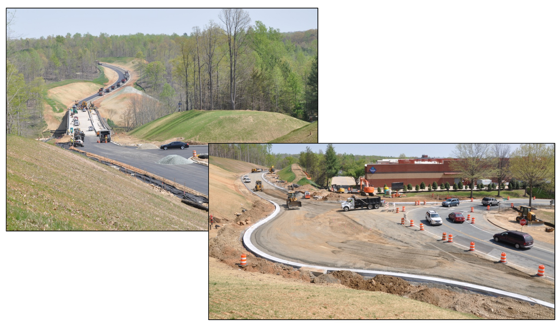
Route 29 Solutions