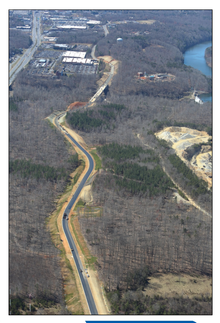
Route 29 Solutions