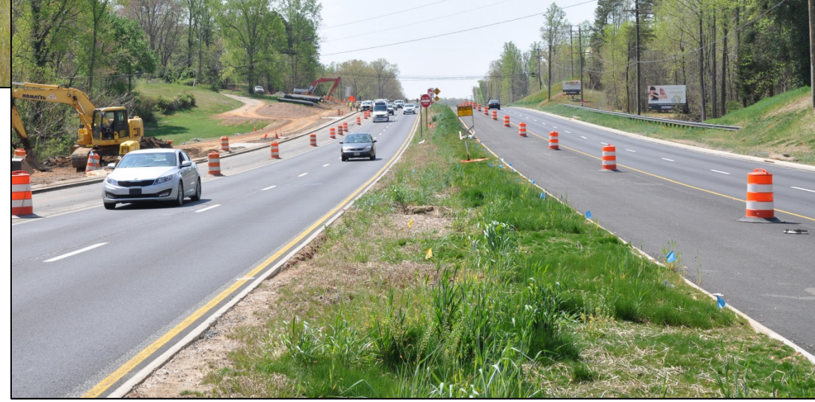
Route 29 Solutions