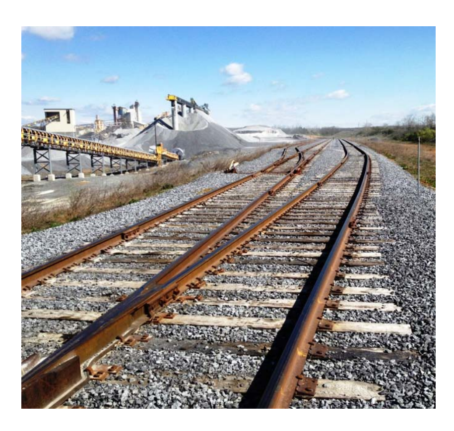
RIA Project: Carmeuse Lime & Stone of Northern Virginia