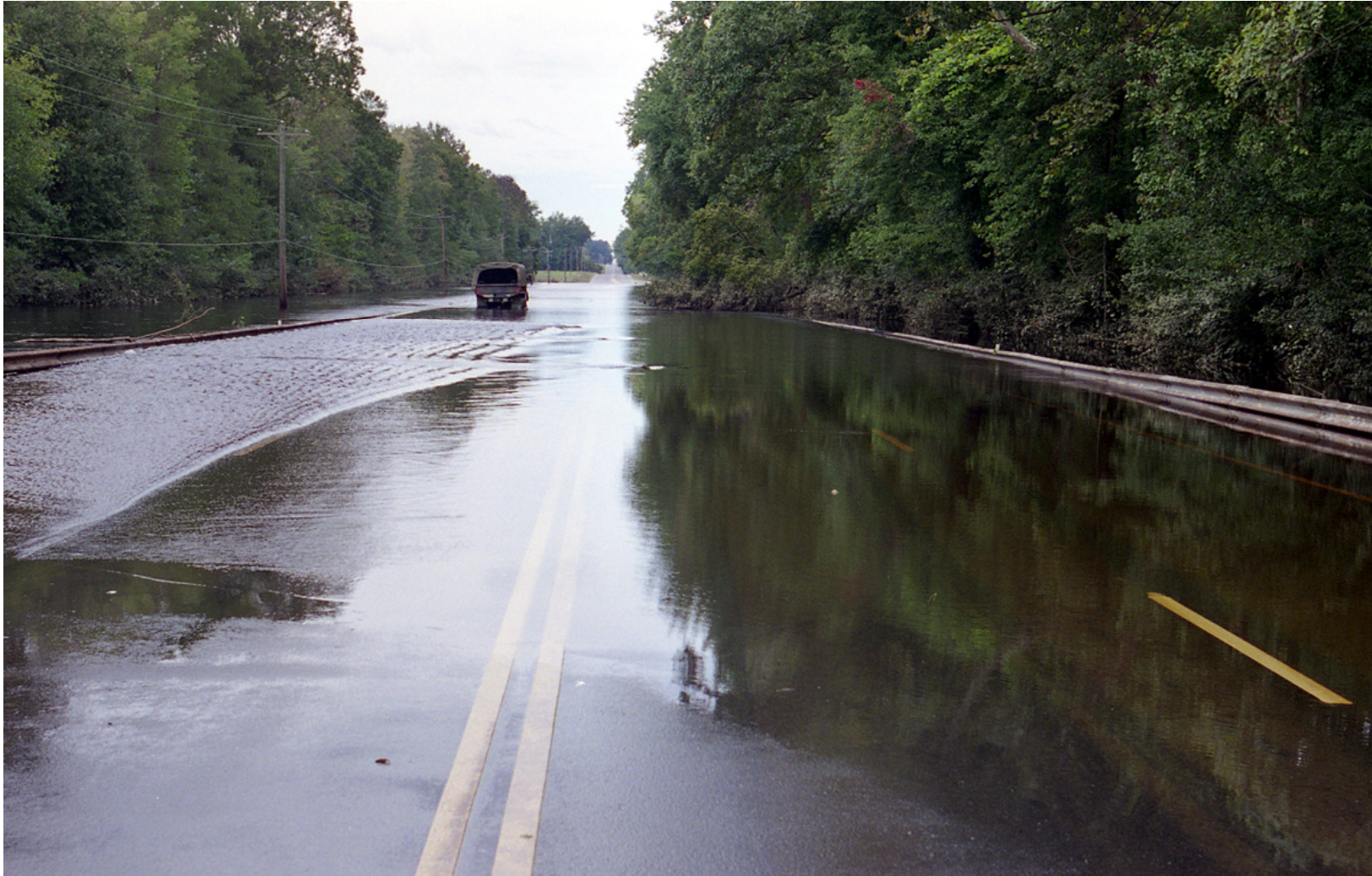
U.S. Route 460, September 22, 1999, Zuni, Virginia