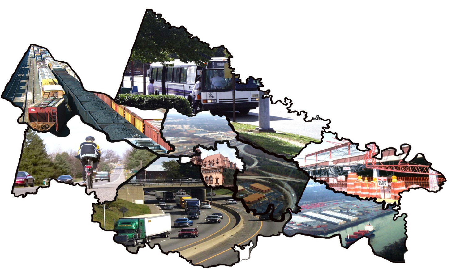
Commonwealth Transportation Board Workshop January 16, 2013